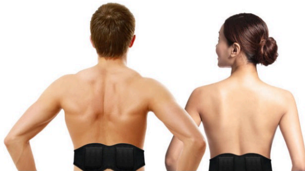
Kidney stones treatment is safe only with Thermobalancing therapy (Posted by Kathy Colace, Community Contributor)